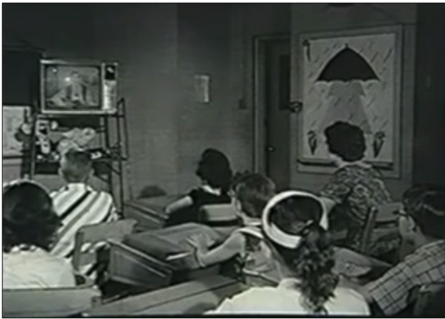
FIGURE 4. A class prepares to watch a televised broadcast (Ohio State University, 1964).