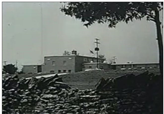
FIGURE 1. MPATI courses were transmitted to six states (Ohio State University, 1964).

Although a novel approach to distributing instruction, the MPATI officially ended after 10 years in 1971 due to an inability to raise enough money to fund the maintenance of the aircraft. This design case will highlight how the novel conception of the MPATI was the first form of satellite television