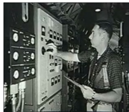
FIGURE 3. Broadcasting equipment stored on a DC-6 (The Ohio State University, 1964).

Principals and teachers reviewed the MPATI curricular offerings together to determine if the televised instruction