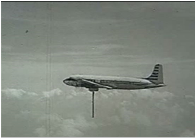
FIGURE 2. Televised broadcasts were aired from the MPATI planes (The Ohio State University, 1964).